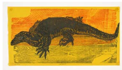
Alistair Bell Water Monitor Woodcut print, 'Trial Proof' on yellow paper 31.7 x 57.1cm 1970