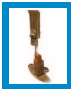
Evidence of Passage, Tiki Mulvihill Wood, snowshoe, leather, hardware, grain, 142cm x 78cm x 182cm, 2002

Explore the style and inspirations of Canadian artist Alistair Bell through drawing and watermedia techniques. Imitate Bell's observation excursions to the boat docks and the zoo using the resources in the kit for sketching 'trips'. Overlapping layers, viewpoint and rhythm are key concepts to be investigated using water-soluble colour and inks.