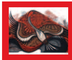
Loon (detail), Prina Granirer Lithograph, 37cm x 56cm, 1978