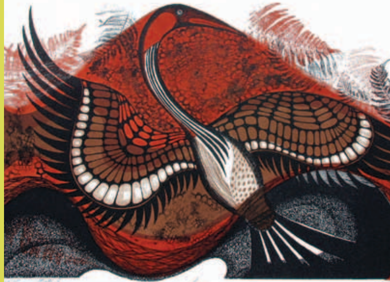
Loon (detail) Pnina Granirer Lithograph 37cm x 56cm 1978

B.A.G. in a Box art kits feature original artwork by local artists, resource materials, art equipment, and detailed lesson plans for theme based art-making activities. Grades K-7.